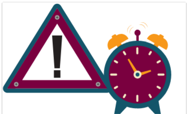
Important dates and examination deadlines

Only with appointment, please book online: > https://termine.ovgu.de